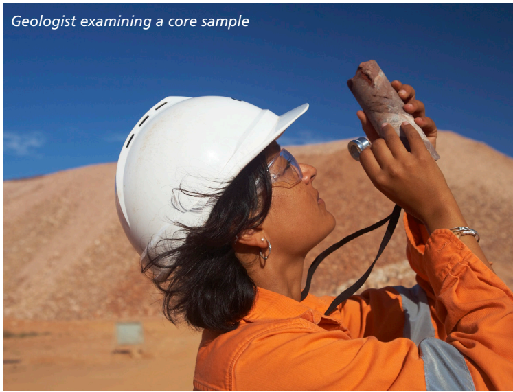
Geologist examining a core sample