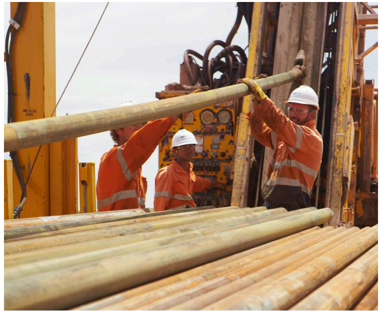
Exploration drillers working at Prominent Hill

OZ Minerals has a strong balance sheet, a team of highly skilled mining industry professionals and a commitment to Respect, Integrity, Action and Results.