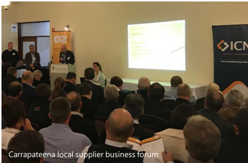
Carrapateena local supplier business forum